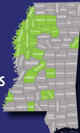
CHART , an "abstinence-plus" initiative, HAS BEEN ADOPTED IN 22 COUNTIES statewide.