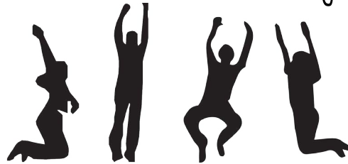
CHART Creating Healthy and Responsible Teens