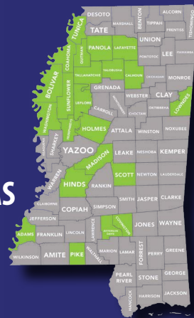
CHART , an "abstinence-plus" initiative, HAS BEEN ADOPTED IN 22 COUNTIES statewide.