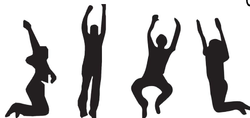
CHART Creating Healthy and Responsible Teens