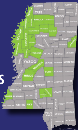
CHART , an "abstinence-plus" initiative, HAS BEEN ADOPTED IN 22 COUNTIES statewide.