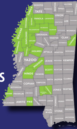
CHART , an "abstinence-plus" initiative, HAS BEEN ADOPTED IN 22 COUNTIES statewide.