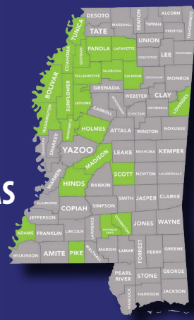
CHART , an "abstinence-plus" initiative, HAS BEEN ADOPTED IN 22 COUNTIES statewide.