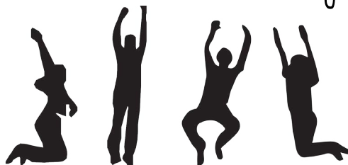
CHART Creating Healthy and Responsible Teens