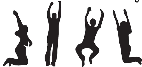
CHART Creating Healthy and Responsible Teens