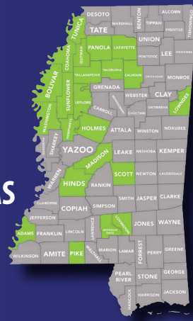
CHART , an "abstinence-plus" initiative, HAS BEEN ADOPTED IN 22 COUNTIES statewide.