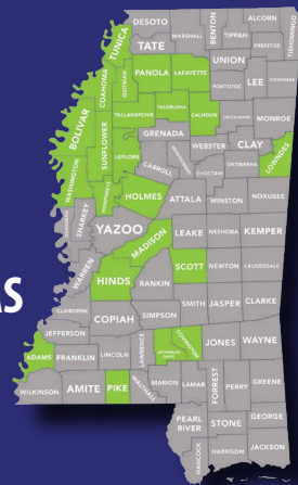
CHART , an "abstinence-plus" initiative, HAS BEEN ADOPTED IN 22 COUNTIES statewide.