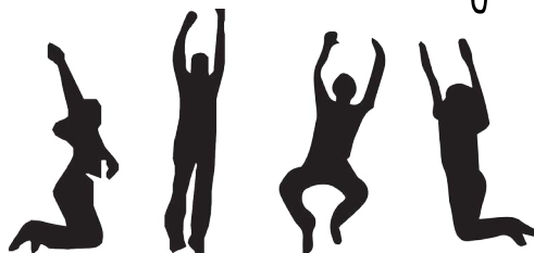
CHART Creating Healthy and Responsible Teens