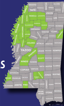
CHART , an "abstinence-plus" initiative, HAS BEEN ADOPTED IN 22 COUNTIES statewide.