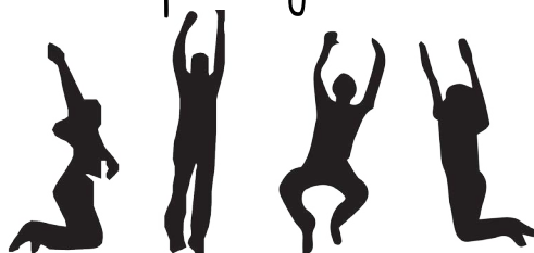
CHART Creating Healthy and Responsible Teens