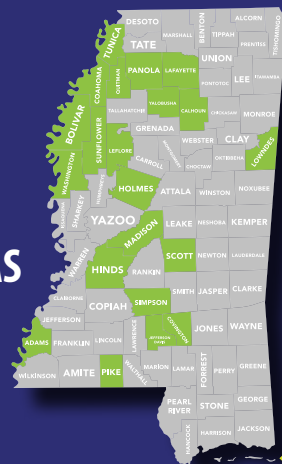
CHART , an "abstinence-plus" initiative, HAS BEEN ADOPTED IN 21 COUNTIES statewide.