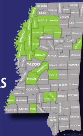
CHART , an "abstinence-plus" initiative, HAS BEEN ADOPTED IN 21 COUNTIES statewide.