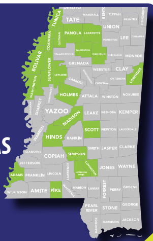
CHART , an "abstinence-plus" initiative, HAS BEEN ADOPTED IN 21 COUNTIES statewide.